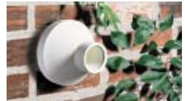
Carrier's concentric vent option combines the two-pipe vent system into one single wall or roof penetration for a cleaner, more finished look.